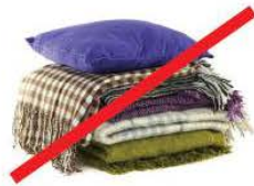
NO Textiles, Bedding, Rugs & Carpet