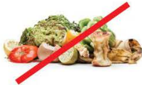
NO Food & liquids