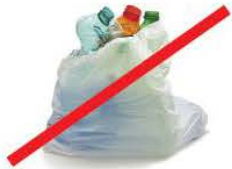
NO Recyclables in Plastic Bags