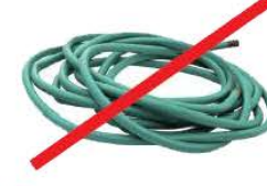
NO Hoses, Holiday Lights, Hangers & Extension Cords