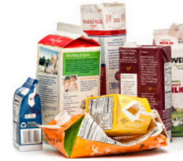
Food & Beverage Cartons