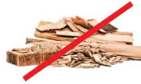
NO Concrete, Wood & Construction Debris