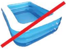
NO Non-Recyclable Plastic