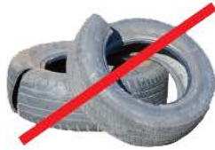
NO Tires, Auto Parts & Scrap Metal (Including Propane Tanks)