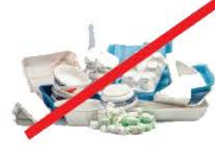
NO Polystyrene Foam