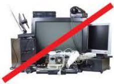
NO Electronics & Small Appliances