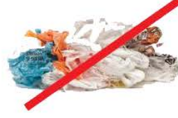
NO Plastic Bags, Film/ Sheeting & Flexible Film Packaging