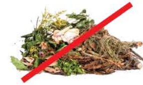
NO Yard Waste & Wood